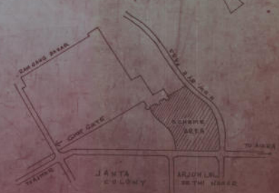
KEY PLAN AT 1:1000 SCALE